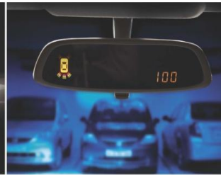
intellipark reverse assist system