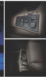
Underseat storage space