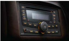
2 DIN audio system