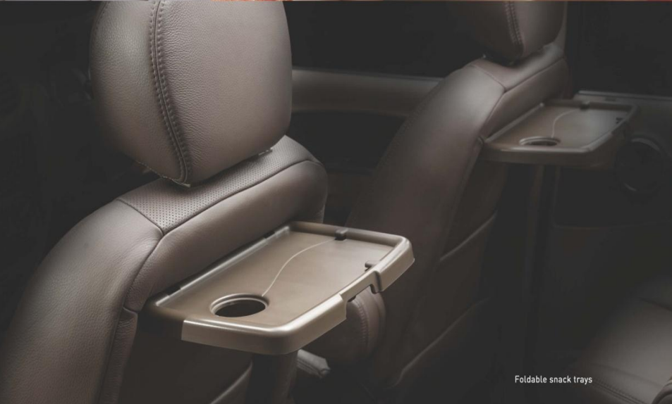
Foldable snack trays