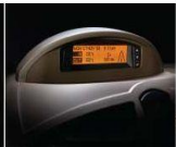
Digital drive assist system