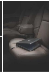
Mobile & Laptop charging point