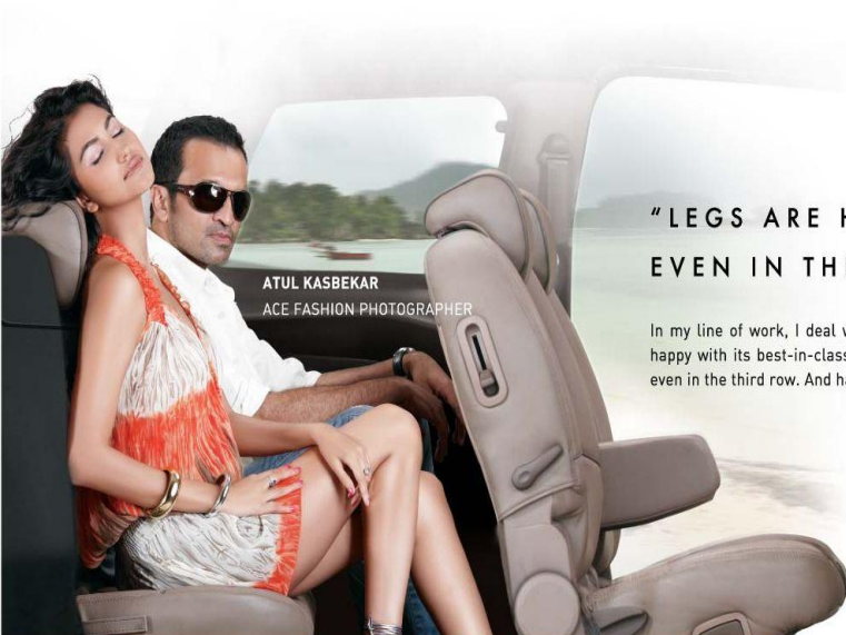
ATUL KASBEKAR ACE FASHION PHOTOGRAPHER

"LEGS ARE HAPPY IN A XYLO, EVEN IN THE THIRD ROW. ASK ME I'M 6 FOOT 3."