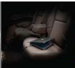
Mobile & Laptop charging point