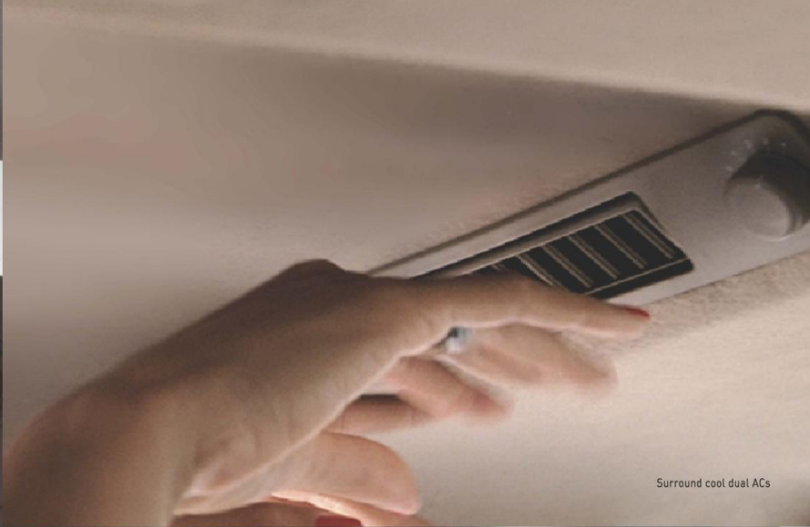
Surround cool dual ACs