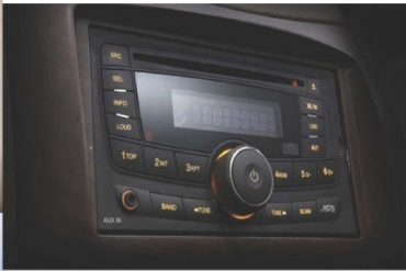
2 DIN audio system