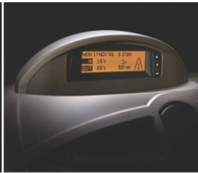
Digital drive assist system